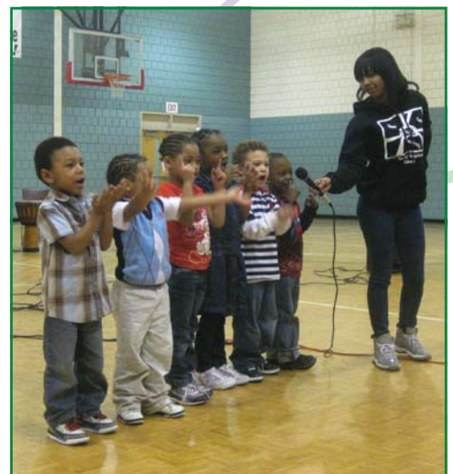
Our Rainbow Room children delight the crowd with a signed performance of "Row Your Boat."