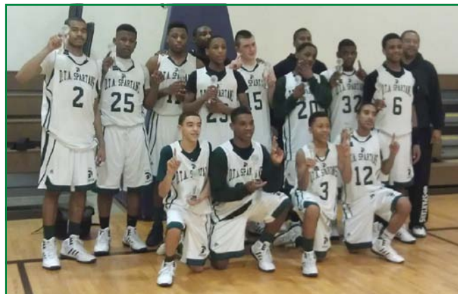
Our 8th grade Spartans AAU basketball team won a 44-team tournament in Lansing, MI in March. The team finished with a perfect 8-0 record.