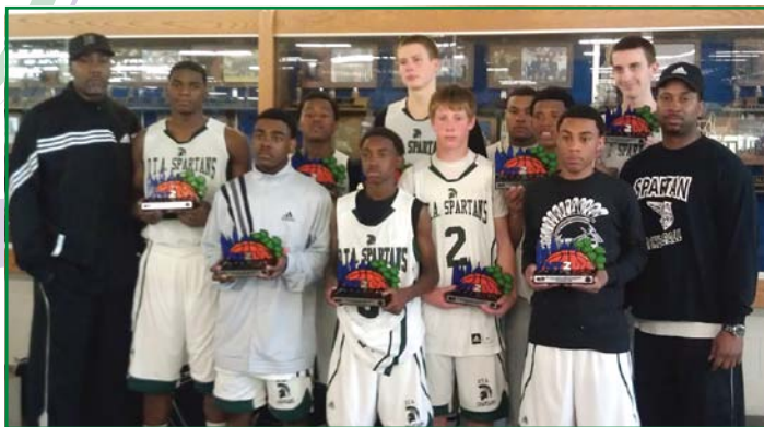
The 9th grade team placed 2nd in the NY2LA Spring Extravaganza held in Bloomington, MN.

Great job, guys! We're all so proud of you!